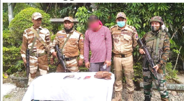
IT News Imphal, Sept 22:

Based on credible intelligence input provided by Keithelmanbi Battalion operations were launched along with Imphal East Commando