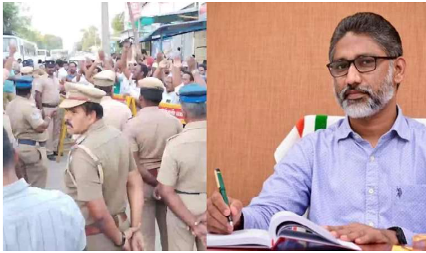
PFI Chairman OMA Salam was also arrested by NIA as massive raids were conducted across the country