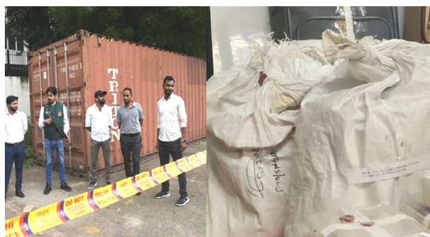
The Delhi Special police personnel at Nhava Sheva Port. (Inset: The seized heroin seized).